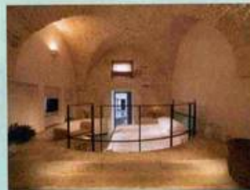
FROM TOP: One of the spacious suites; the luxurious swimming pool

RATES: €75-€140 (around £66-£122), including breakfast.