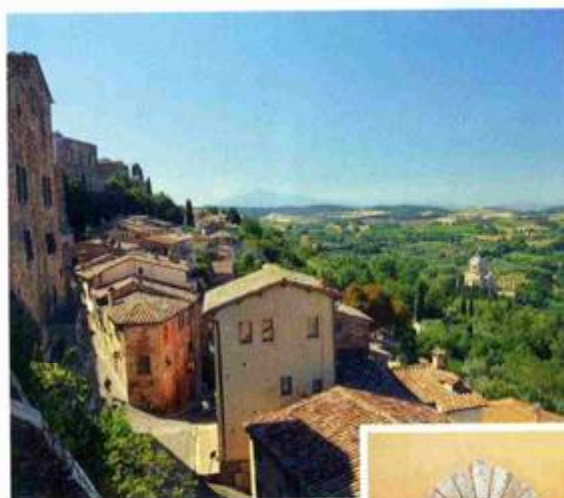
FROM LEFT: The hillside town of Montepulciano; a typical Tuscan side street